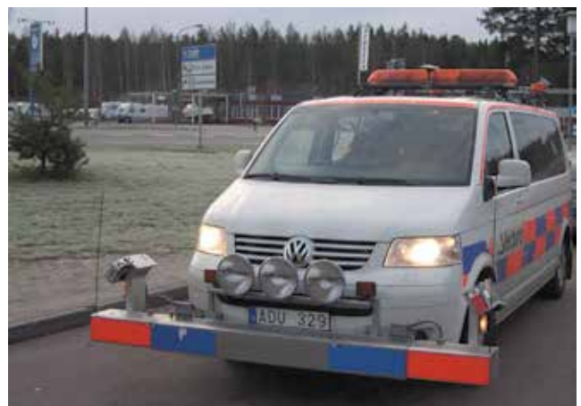
Figure 1. Laser system for recording road condition, [17]

Subjective assessment methods are based on appropriate forms filled in by road users and experts who state their opinion on a particular road segment, based on road inspections. Krishna Rao [15], Douangphachanh and Oneyama [11], as well as many other authors, argue that subjective methods are extremely expensive due to the time necessary to collect data and the constant on-site presence of researchers and field experts during such inspections.