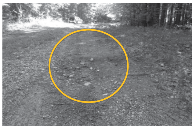
Figure 2. Pothole on a forest road segment

Condition of the upper layer of the forest road was assessed by measuring vibrations on the 300 m long segment of a forest road in the Training and Research Center Zalesina, Faculty of Forestry - University of Zagreb, Croatia. The selected forest road segment is situated on a flat terrain without longitudinal slope, and with two curves, one at the beginning, and the other at the end of the segment. Pavement damage at the road segment was recorded at the vehicle wheel driving directions. Two potholes were registered: the first one, 1 m in length and 10 cm in depth, was observed 70 m after the beginning of the test track, and the other one, 0.6 m in length and 6 cm in depth, was registered 200 m after the beginning of the test track.